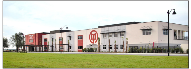
Babcock Neighborhood School opens in new permanent home on the central education campus