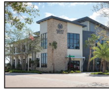
Groundbreaking for Babcock Neighborhood School