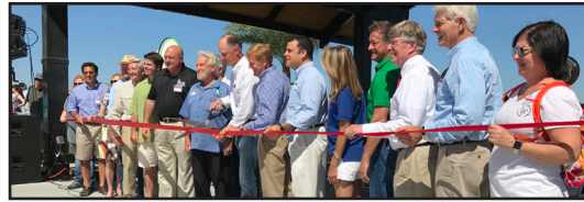
Founder's Fest marks opening of first model homes, Discovery Center and Table & Tap Restaurant