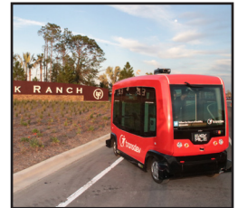
Launch of autonomous shuttle service