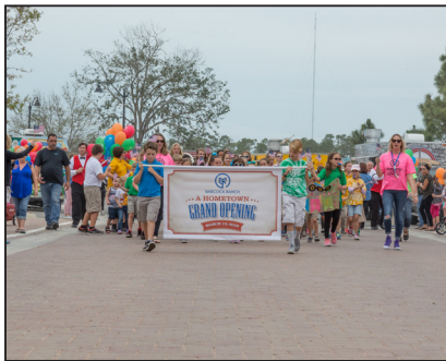
Opening of Recharge Juice