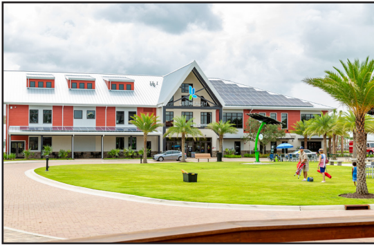
Grand opening of Lee Health Healthy Life Center