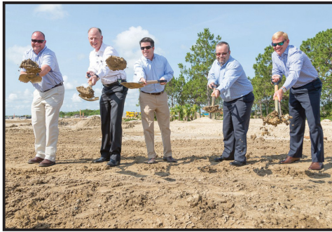
Groundbreaking for Founder's Square