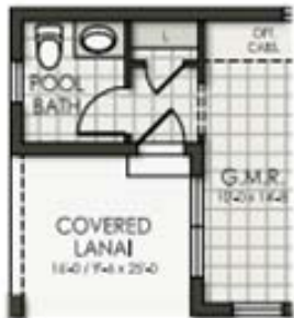
POOL BATH OPTION POOL BATH 73 S.F. LANAI 345 S.F.