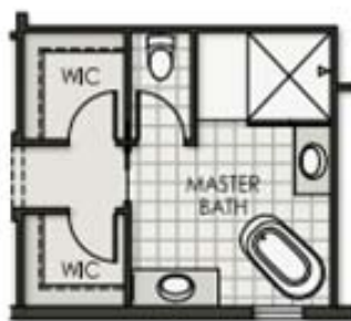
MASTER BATH OPTION